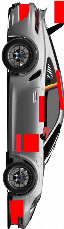
Regular Season Base Livery Restricted Areas